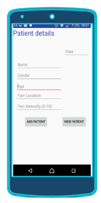
Fig. 1 Display of simplified mobile app