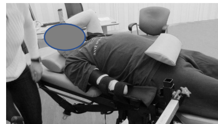
Figure 3: Prosthesis User with Adapter Fitting. The user was asked to lay comfortably on the dynamometer and place his residual limb in the adapter.