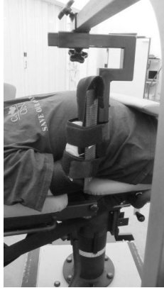
Figure 4: Prosthesis Adapter in Preparation for Exercise. The prosthesis user has placed his residual limb in the adapter and is prepared to complete a series of contractions using the device.