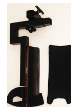
Figure 2: Prototype Adapter. The adapter connects to the centre of rotation of the isokinetic dynamometer.