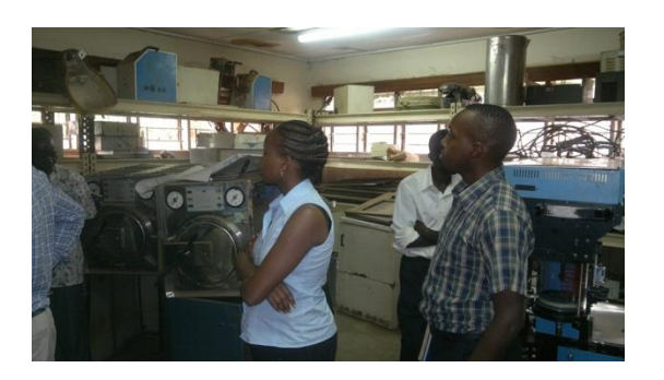
Figure 1.1 Unused donated medical equipment at the Mulago Hospital Workshop, Kampala, Uganda